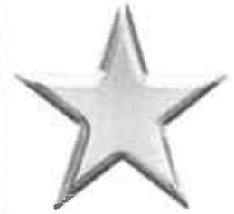
Well done to all of our Stars of the Week award winners.