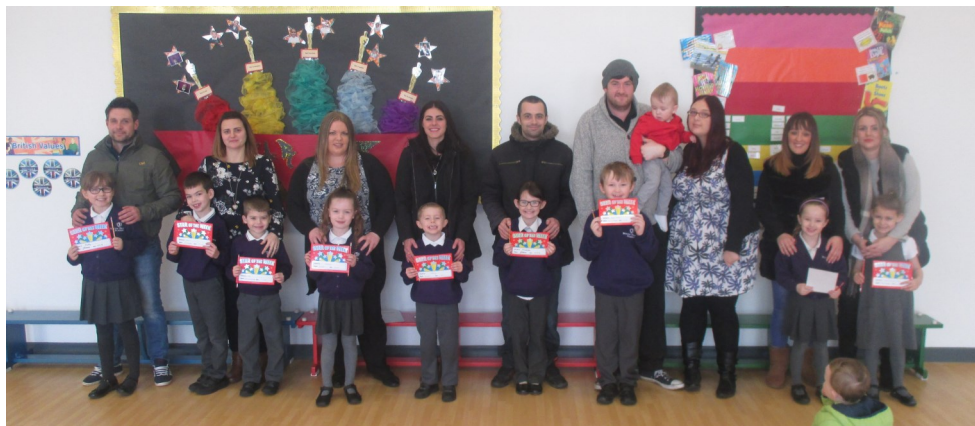
Well done to our amazing award winners this week—keep up the great effort!